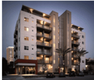
475 Condominiums, Clemmons Architecture

Also receiving a Merit Award was RBK Architects, Inc. for their Ybor City Loft project. The modern 8-unit condominium is situated in the historic district of Ybor City. The 1930's house was precedent for the building's clean lines, stucco finish, dark metal details and simple yet playful window and door openings. More project images