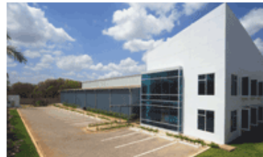
Glacial Water & Ice Manufacturing Plant, Ai Collaborative, Inc.

A Merit Award was also presented to Ai Collaborative, Inc. for the Glacial Water & Ice Manufacturing Plant . The project was necessitated by the owner's creation of a new brand of locally produced drinking water and bagged ice and to provide a facility design that reaches beyond a simple utilitarian structure. More project images