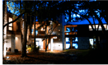
Hoffman's Residence, Hoffman Architects P.A.