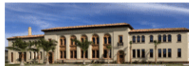
Seybold Lofts, Clemmons Architecture