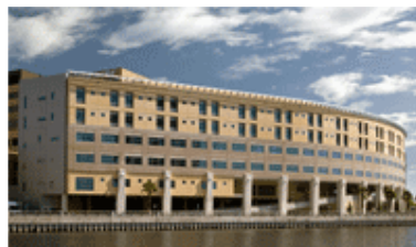
Tampa General Hospital Bayshore Pavilion, Gresham, Smith & Partners

projects entered into the design awards were posted at www.aiatampabay.com and the public was invited to vote for their favorite. Gresham, Smith & Partners Tampa General Hospital Bayshore Pavilion addition was the project most liked by the People of Tampa Bay. It earned approximately 200 out of more than the 1,100 votes that were cast.