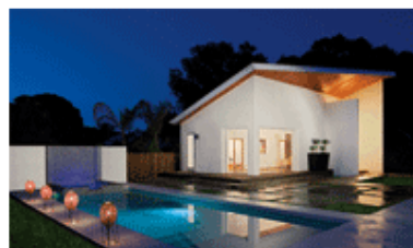
Mumford Pool House, Jonathan Parks Architect

Also receiving an Honor Award was Jonathan Parks Architect for their design of the Mumford Pool House , a complement to a 1926 historic cottage. The design centered on creating an elegant backyard family area for the owners. Both being design professionals, they requested a pool house, pool and landscape layout that embraced a modern design and expanded living space. The design blurs the lines