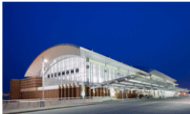
Richmond International Airport Terminal Expansion, Gresham,Smith & Partners

Gresham Smith and Partners were recognized with a Merit Award for their Richmond International Airport Terminal Expansion project. Construction began in 2005. The new terminal building currently supports nine airlines, with ample space for additional carriers. It is made up of 28,000 SF of glass and 100,000 SF of terrazzo flooring. More project images