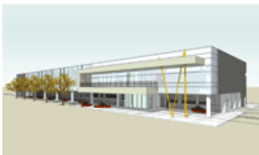
Suncoast Federal Credit Union's Information Technology Building, Holmes Hepner & Associates

Tampa-based Holmes Hepner & Associates Architects were recognized with a Merit Award for their design of Suncoast Federal Credit Union's Information Technology Building in Tampa. This state-of-the-art facility will accommodate approximately 120 employees while providing an enclosure to withstand a category 5 hurricane, it also incorporates a curtain-wall system with reflective laminated