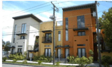
Ybor City Loft, RBK Architects, Inc.

Also receiving a Merit Award was RBK Architects, Inc. for their Ybor City Loft project. The modern 8-unit condominium is situated in the historic district of Ybor City. The 1930's house was precedent for the building's clean lines, stucco finish, dark metal details and simple yet playful window and door openings. More project images