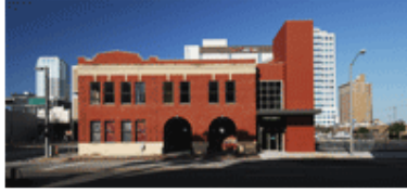
Tampa Fire Fighters Museum, Sherman and Associates

Merit Awards were presented to eight projects. Sherman and Associates were recognized for their restoration and addition to the Tampa Fire Fighters Museum in downtown Tampa. The original two-story, 12,000 SF building was expanded with a three-story, 4,600 SF addition, which was designed to complement and contrast with