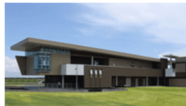
Hillsborough Community College Multipurpose Facility, Gould Evans

Honor Awards were presented to two projects including the Seybold Lofts , designed by Clemmons Architecture . The 1926 Seybold Bakery building is a City of Tampa historic landmark. Located in Tampa's north Hyde Park neighborhood, a former bread factory, it was master-planned to include 33 lofts within the existing two-story building, a new four-story 16-unit condominium building, 12 three-story town homes, and four narrow-lot single-family homes. The main goals were to preserve and restore the building's exterior and maintain many of the industrial construction elements of the interior.